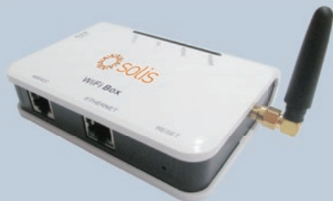
Data Logging Box DLB